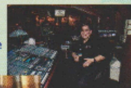
Mickey - Nashville